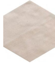
SOLOS HEX FENDI