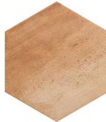
SOLOS HEX ARGILA