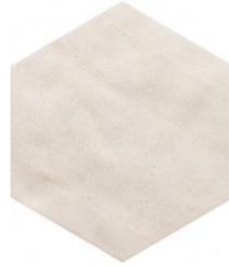
SOLOS HEX SHELL