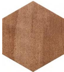
SOLOS HEX TERRACOTA