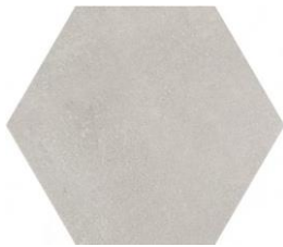
18x20,8cm | 7"x8" MA (MATTE)