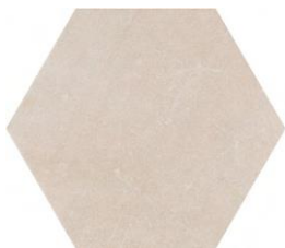
18x20,8cm | 7"x8" MA (MATTE)