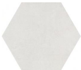
18x20,8cm | 7"x8" MA (MATTE)