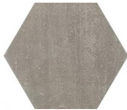
18x20,8cm | 7"x8" MA (MATTE)